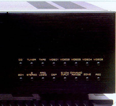
The processor acts as the control centre...