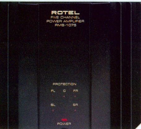
... while the RMB-1075 delivers the power