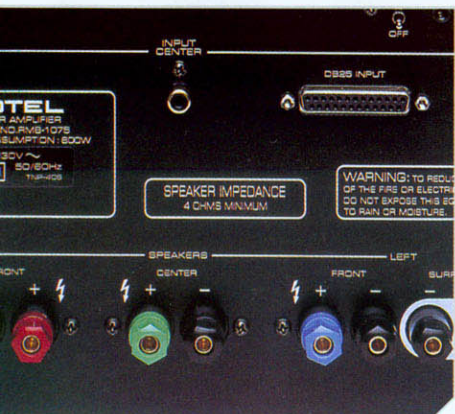
Each of the five channels has a binding port

ROTEL RSP-976/ROTEL RMB-1075 ♦ £900/£800 ♦ 01908 317707 (GAMEPATH) ♦ www.rotel.com