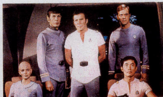
The Rotel faithfully decoded the faded dialogue of the Enterprise crew from the DVD of Star Trek: The Motion Picture .

Multichannel recordings on the new high-resolution media, Super Audio CD (SACD) and DVD-Audio, also sounded fine — the receiver's ample power capabil-