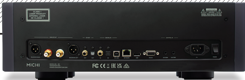
ABOVE: Balanced XLR and unbalanced RCA outputs are joined by optical and coaxial outs (CD transport), optical and coaxial (192kHz/24-bit) and USB-B (384kHz/32-bit, DSD256) inputs, Ethernet (artwork, firmware), USB (firmware), and control/RS232 ins

'Hail Caesar!' the individual strands of the backing vocals were easy to hear, not just lost in a mass.