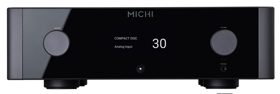
S2 Series 2